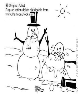
"Just once I'd like to meet someone who wasn't a fair weather friend."

5. If you were another person, would you like to be a friend of yours?